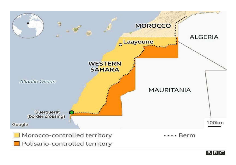
Appendix B. Western Sahara after Division

2011www.google.com/amp/s/www.bbc.com/news/world-africa-14115273.amp.