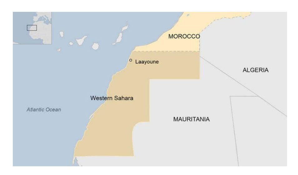
Appendix A. Western Sahara before Division